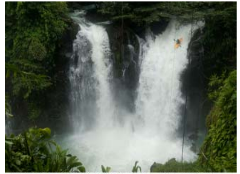
MANDATORY PHOTO CREDIT: ©The Last Frontier — Papua New Guinea. Courtesy of The Banff Centre

A special Banff pre-event party across the street at Great Basin Brewing Company runs from 4 - 6:30 p.m. with sneak peeks at some of the films and advance raffle ticket sales. Doors open at the Nugget at 6:00 p.m. with an array of exhibitors, no-host bars, and an incredible raffle of outdoor adventure products and a rafting trip. Films begin 7 p.m. and run until about 10:00 p.m. For more details on this event, please call the Nevada Land Conservancy at 851-5180 or visit www.nvlc.org .