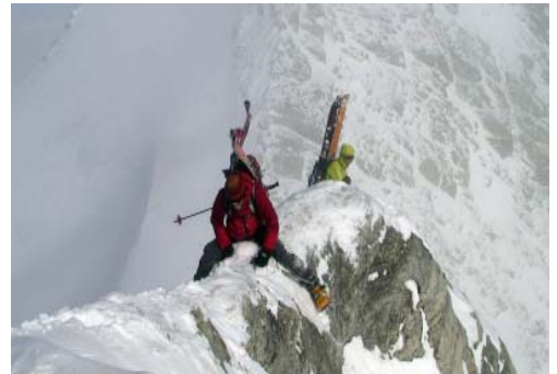
MANDATORY PHOTO CREDIT: ©The Unbearable Lightness of Skiing. Photo by Greg Hill, courtesy of The Banff Centre

Film buffs and outdoor enthusiasts alike will enjoy a selection of award-winning films celebrating mountain culture and sports such as skiing, kayaking, and mountain biking during this three-hour event with five big screens at John