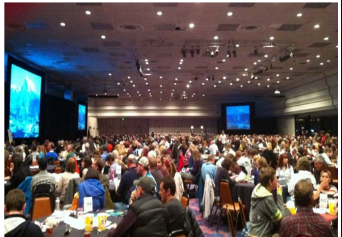
The crowd in John Ascuaga's Nugget's Rose Ballroom enjoys the 2011 Banff film festival

Mark your calendars! The Banff Mountain Film Festival returns to the Truckee Meadows on Thursday, April 5, 2012 at John Ascuaga's Nugget! ❖