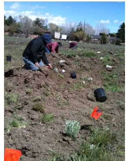
Crews planting seedlings at Dorostkar Park

Our 2011 weed action plan includes fall treatment of Medusahead and additional restoration projects, all planned to improve the health of our community's natural resources. Fighting weeds is a constant battle, but we're fortunate in the Truckee Meadows to have a community that supports weed control and restoration work. ❖