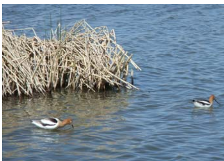
Avocets at Swan Lake