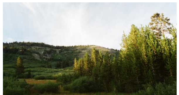
Sheep Flat at Tahoe Meadows