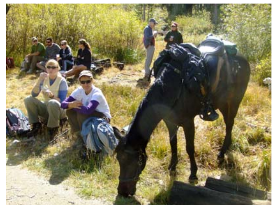
Participants at the 2010 hike relax at trail's end

Silver Peak Restaurant and Brewery is located at 124 Wonder Street, the Silver Peak Grill and Taproom is at 135 N. Sierra Street, and the new Slice of the Peak is located at 300 E. Second Street. For hike details, please call Nevada Land Conservancy at 775-851-5180. ❖