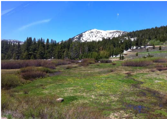
Sheep Flat in the summer

Imagine yourself in the Tahoe Meadows, known to many as Sheep Flat, in the shadow of Mount Rose. It's an 8,000-foot-high bit of heaven between Reno and Lake Tahoe. You're there to bike the Tahoe Rim Trail, snowshoe during the full moon, take the kids sledding, go running with the dogs, or picnic with your