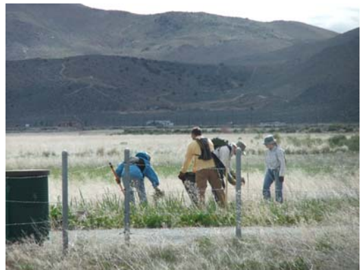
Volunteers at Swan Lake, 2010

Details: Becky Stock at Nevada Land Conservancy 775 851-5180, or becky@nvlc.org. ❖