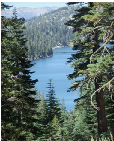
Beautiful Marlette Lake

available near the lake. Bikes are available for rent at Spooner Lake --775-749-5349 and www.flumetrail.com .